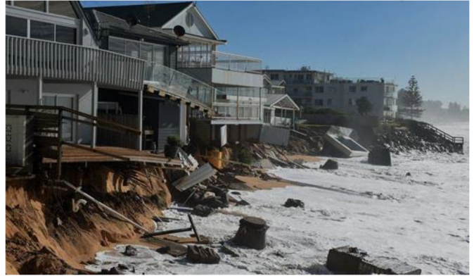
June 2016 Storm Damage – Sydney

emergency response as it happened. A panel discussion explored what can be learnt from this event to make our coastal communities safer, maritime infrastructure more resilient, and how to achieve these within conflicting stakeholder expectations.