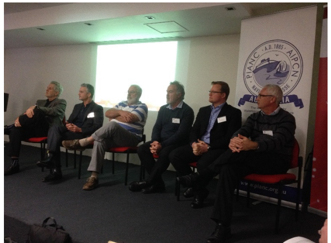
Panel Discussion at PIANC/COPEP Annual Seminar

8 November 2016 - Auckland, Half day workshop on Dredging (35 attendees). A number of speakers from different backgrounds discussed various dredging aspects from approvals and monitoring to planning and operations.