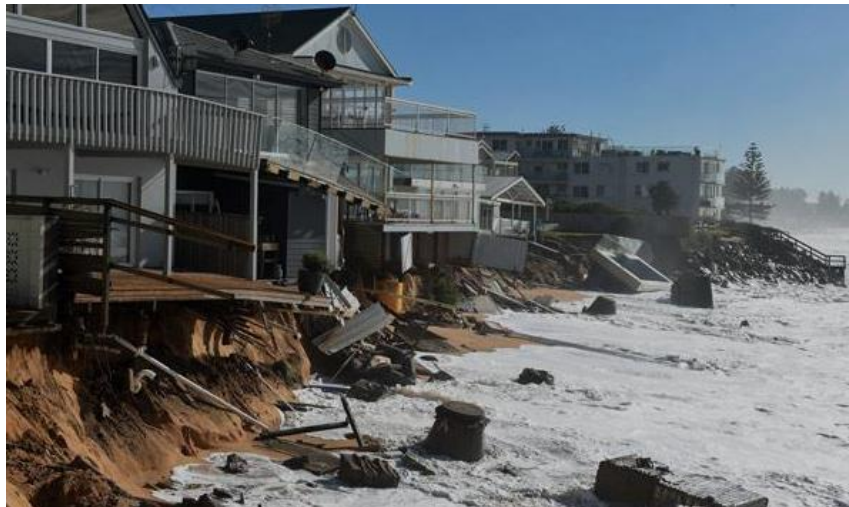
June 2016 Storm Damage - Sydney