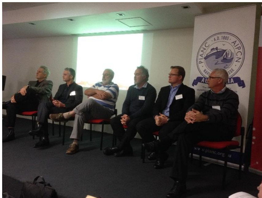
Panel Discussion at PIANC / COPEP Annual Seminar